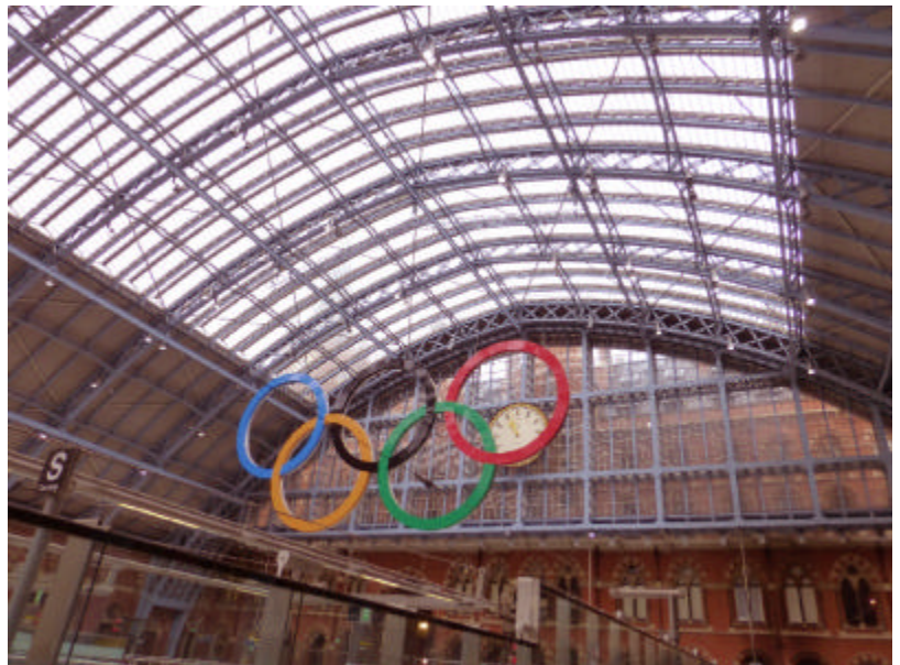
The Olympic Rings at St. Pancras