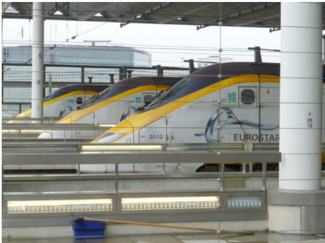
Eurostars line up.....