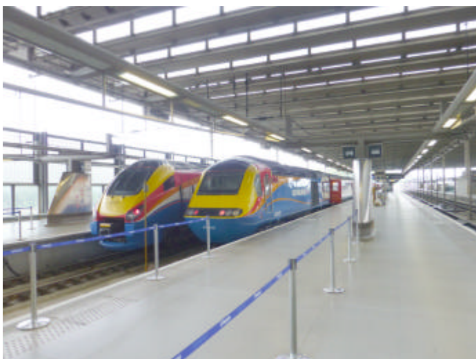
No loco hauled trains here.