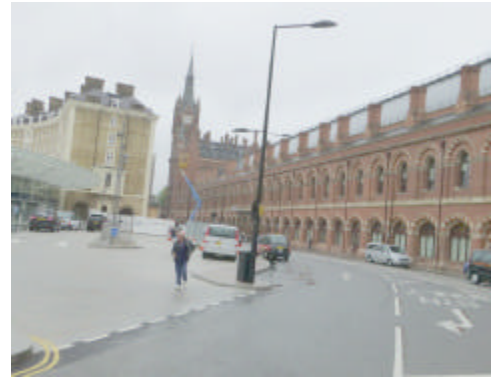
Between the stations.

Decided to type this up then email. Lots to do tomorrow - as it starts the trip in the UK properly.