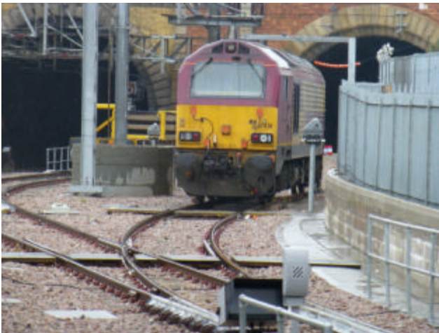
First loco seen.. Standby duties ???