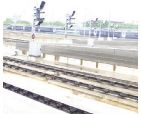
Signal in the rain.....

There was so much I did not know - to find Kings Cross station across the street - so a short walk across to the Kings Cross station. Again a fascinating station with roof and a range of DMU's and HST's. Off to a street map to see what was close - Euston Station was down the street. So a longer walk down Euston Road to Euston Station. This was as interesting too, the buildings, the buses etc. At Euston had a lunch break once I found a shop that appealed to me. One observation I just could not find a rubbish bin and the original shop I bought my food took the rubbish for me. Didn't wander as much at this station.