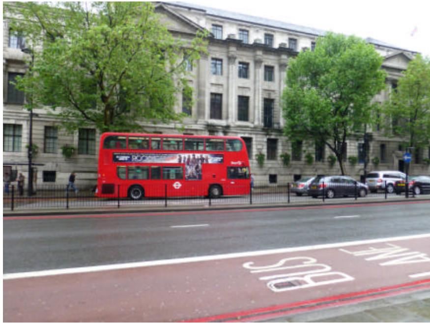
LONDON BUS - seen in London !