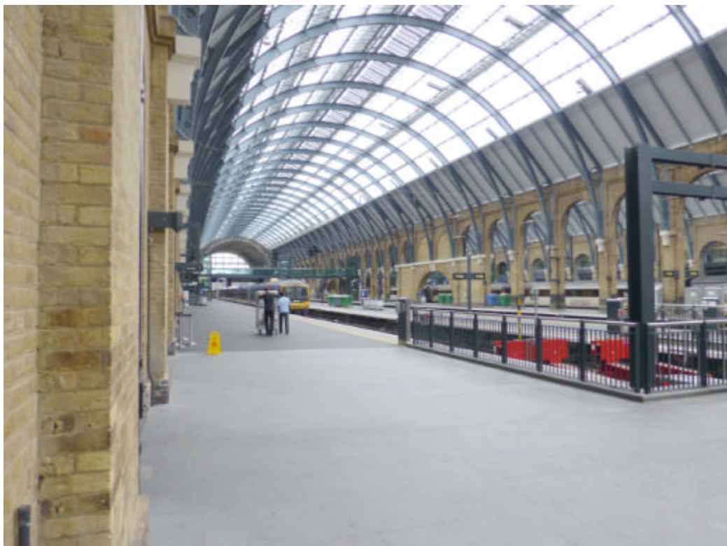
Kings Cross Station roof one section.