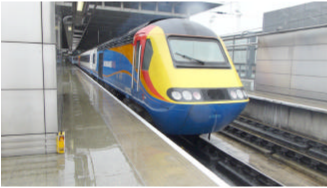
The HST, class 43, our XPT cousin

Deciding on what to do was easy - train stations. A bit of a walk though through the passageways. In the tube they have a map of the line so I could work out where to go. I decided to go to St. Pancras station to see the Eurostar. The amount of people surprised me. Then I realised today was the big river pageant for the Queen's Diamond Jubilee - a big deal and here I were for the day !