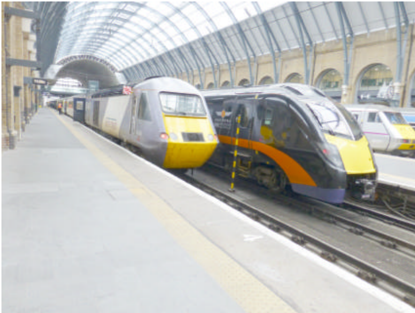
Trains in King Cross Station