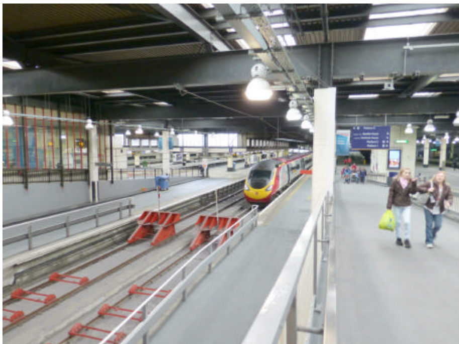
Euston Station - didn't wander this one. Iching to sleep at hotel.