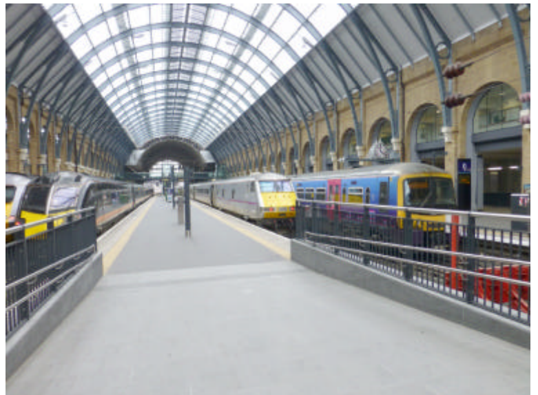
Another Kings cross shot