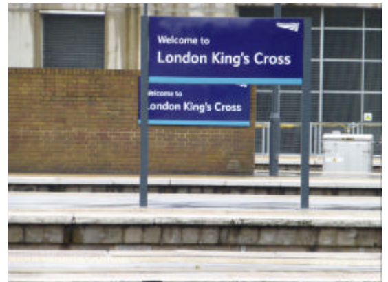
"Read the sign..."